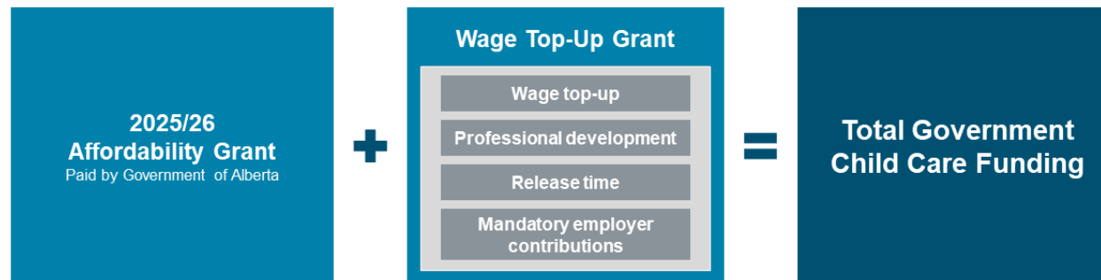
Figure 2 – Daycare Affordability Funding Calculation

For existing programs, determine monthly funding by applying the steps outlined below and multiplying by the number of children enrolled in each age group separately.